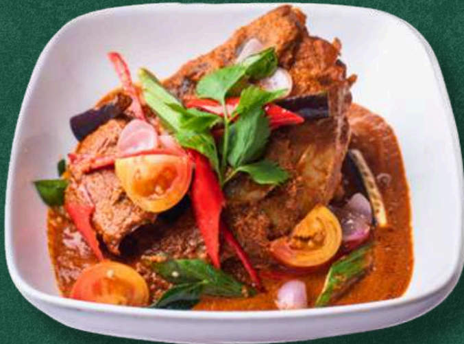
Fish Head Curry 咖喱鱼头

A sweet, salty and spicy fish curry with ladies' fingers and brinjal, served with steamed jasmine rice. 甜, 咸, 辣风味咖喱鱼头, 配羊角豆与茄子, 附茉莉香米饭