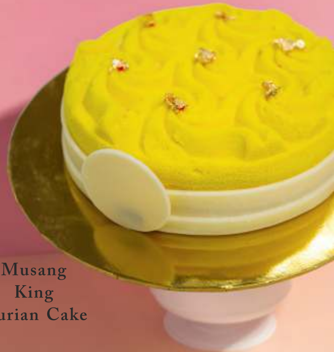
Musang King Durian Cake

All prices are in nett and inclusive of the prevailing service tax