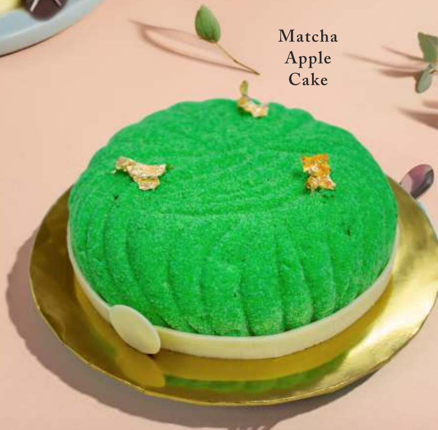
Matcha Apple Cake