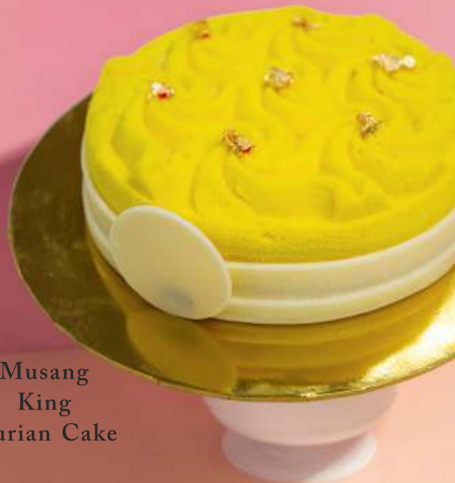
Musang King Durian Cake