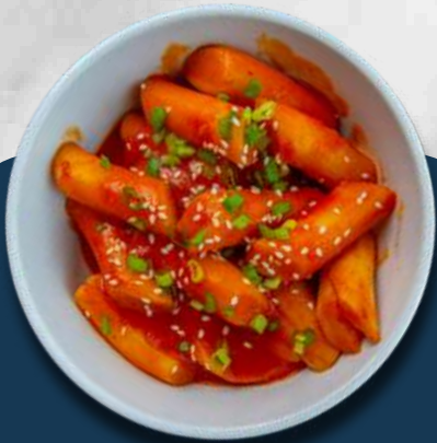
Tteobokki (Rice Cake)