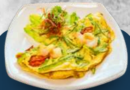
Fried Egg with Bitter Gourd and Shrimps