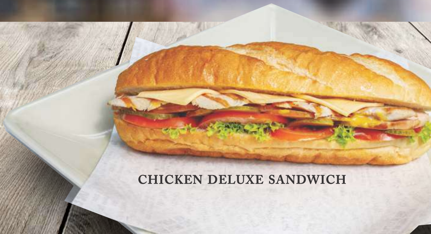
CHICKEN DELUXE SANDWICH

All prices are in nett and inclusive of the prevailing service tax