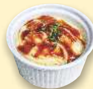
Creamy Mashed Potato RM8.00nett