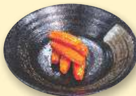
Buttered Carrots RM8.00nett