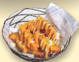
Cheesy Wedges 芝士薯角 RM11.00nett