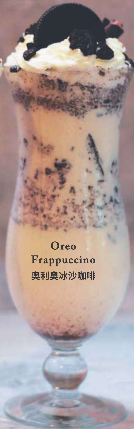
Oreo Frappuccino 奥利奥冰沙咖啡