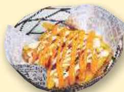
Cheesy Fries 芝士薯条 RM11.00nett