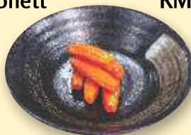
Buttered Carrots 黄油胡萝卜 RM8.00nett