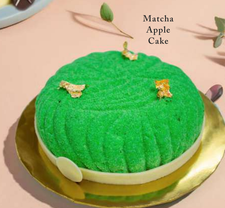
Matcha Apple Cake