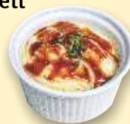
Creamy Mashed Potato 奶油马铃薯泥 RM8.00nett