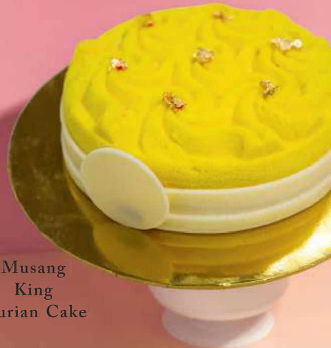
Musang King Durian Cake