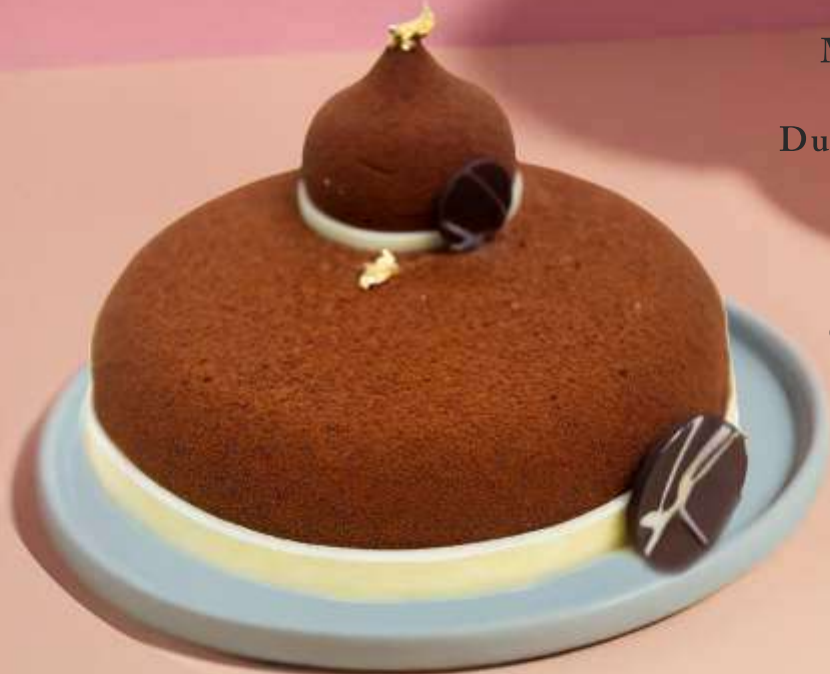
Araguani Chocolate Hazelnut Cake