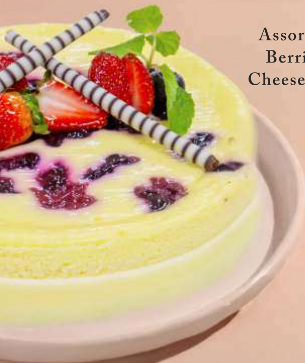
Assorted Berries Cheesecake