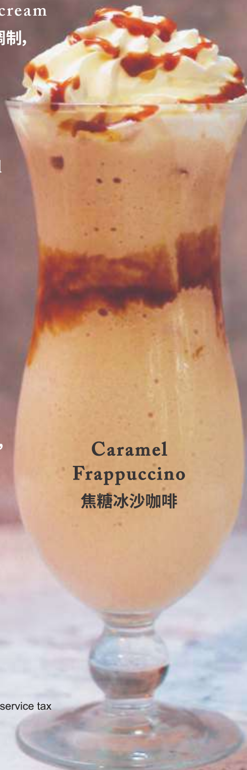
Caramel Frappuccino 焦糖冰沙咖啡

Your choice of flavour: vanilla, chocolate or caramel 自选口味:香草、巧克力或焦糖