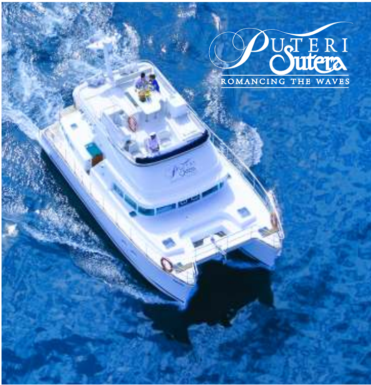
The Puteri Sutera